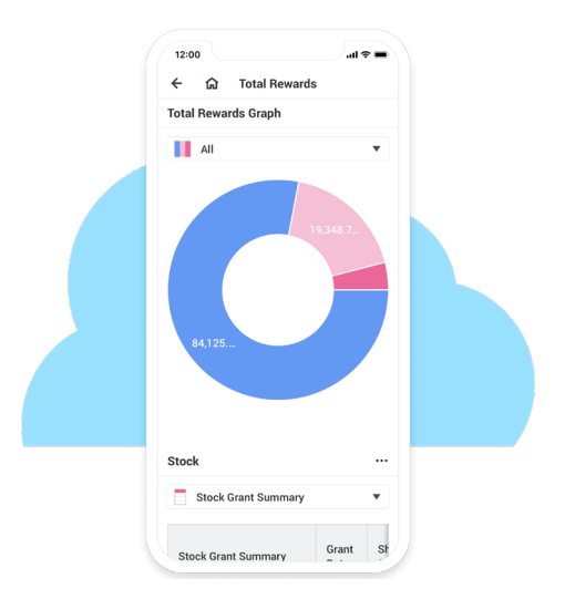
Total rewards statement.

To explore how Workday Compensation can streamline your compensation processes, visit: workday.com/compensation